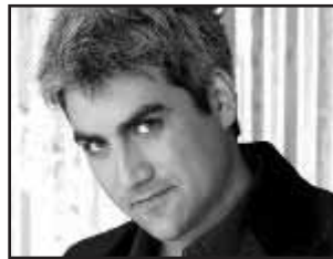
TAYLOR HICKS AUGUST 10 | 8 PM