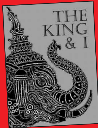
THE KING & I JUL 26 - AUG 3, 2008