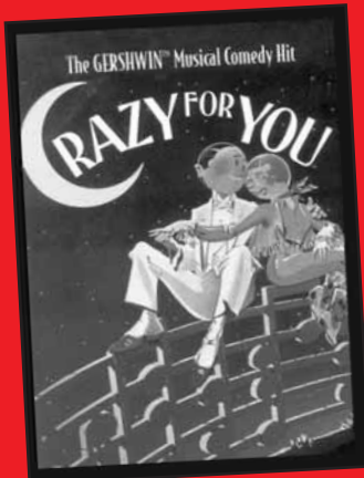
CRAZY FOR YOU MAY 3 - 10, 2008