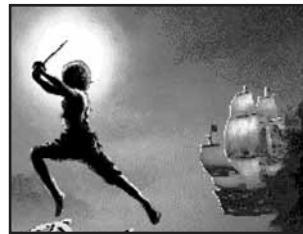
PETER PAN JULY 28 - AUG 5