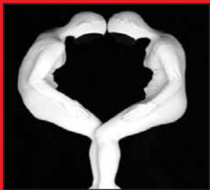
MOMIX LUNAR SEA JAN 12 & 13