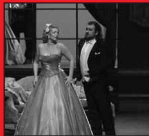
LA TRAVIATA MARCH 8 | 8 PM