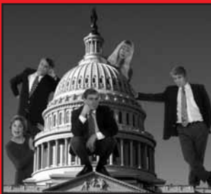
CAPITOL STEPS JAN 26 | 8 PM