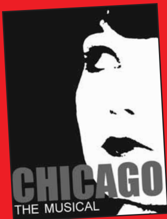
CHICAGO Nov 3 - 10, 2007

SUBSCRIBE TODAY SEE ALL 5 MAIN STAGE MUSICALS FOR $90 & CHANGE!