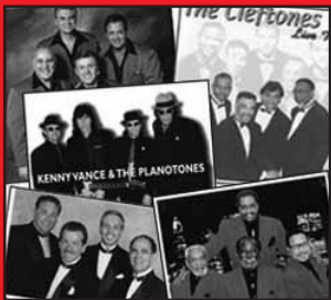
A HOLIDAY ROCK & ROLL CELEBRATION VOL II DEC 15 | 7:30 PM