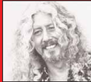
ARLO GUTHRIE Nov 18 | 7:30 PM