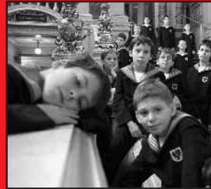
VIENNA CHOIR BOYS DEC 9 | 2 PM