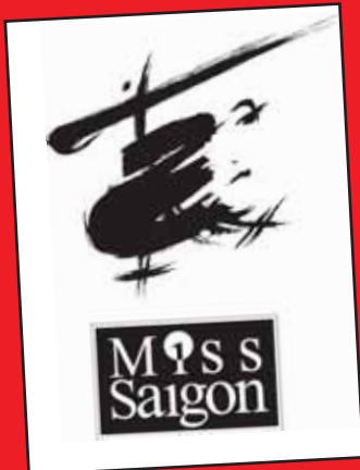
MISS SAIGON MAR 29 - APR 6, 2008