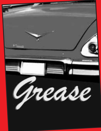
GREASE FEB 16 - 23, 2008