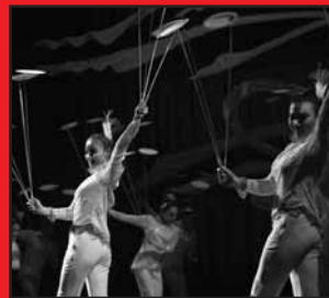
GOLDEN DRAGON ACROBATS APRIL 19 | 7 PM