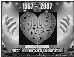
SUMMER OF LOVE 2007 JEFFERSON STARSHIP JUNE 30 | 7 PM

VISIT OUR WEBSITE AT WWW.WARNERTHEATRE.ORG FOR FURTHER INFORMATION ON UPCOMING EVENTS!