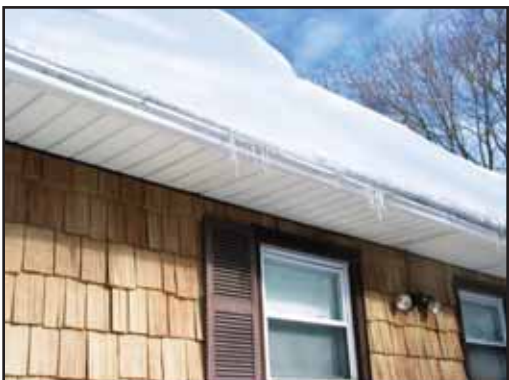
Snow is one of a variety of seasonal factors that can negatively affect a roof over time.

• Is this a current or past problem? Not all signs are indicative of a current problem. For example, if a dark spot on your ceiling