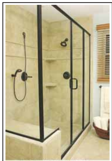
Radiant heating provides a nice, warm bathroom floor to step onto after a shower.

ly heated homes as a separate system. Homeowners who are interested in having a warm floor to step onto after a shower can ask their home-heating contractor for all the facts about radiant heating -- one of the country's fastest-growing opportunities for home comfort in any home. For more information on radiant heating or other forms of hydronic heating systems and equipment, visit www.myhomeheating.com , write to the Hydronics Industry Alliance, 2107 Wilson Boulevard, Suite 600, Arlington, VA 22201, e-mail myhomeheating@gamanet.org